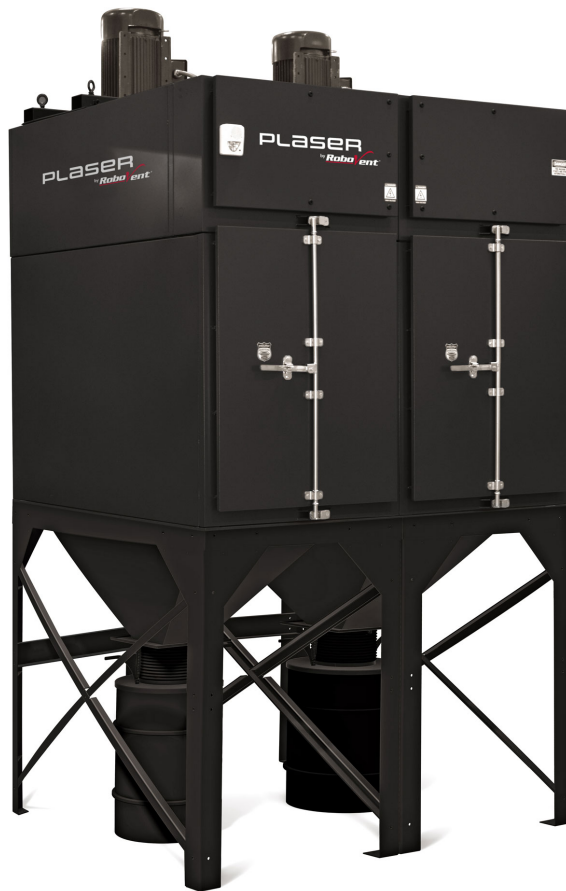
Robovent Plaser collector

Park Industries partnered with fume collector manufacturer, RoboVent, to optimize the air flow characteristics of the system using computational fluid dynamics (CFD) software.