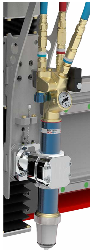
IHT FIT + Three machine torch